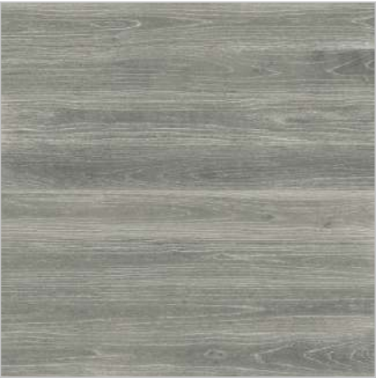
RIGA DARK GREY