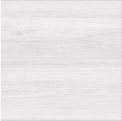
FOREST LIGHT GREY