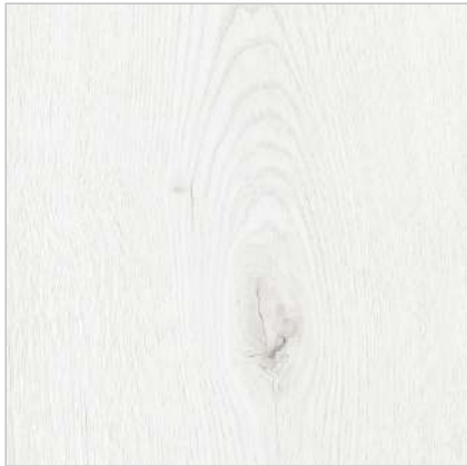
DRIFT LIGHT GREY